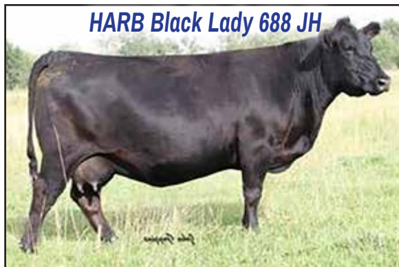
HARB Black Lady 688 JH