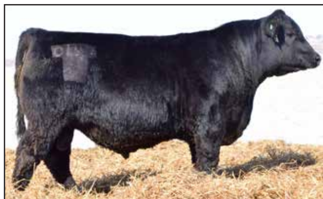
D A R Hot Lotto 0147 - Lot 53

Another big butted Lotto son from the N842 flush. He's a very complete individual that will sire some real performance cattle in the future.