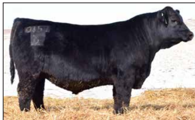
D A R Alpine 0157 - Lot 73

An Alpine son that is a flush brother to Lot 75. Heifer bull deluxe.