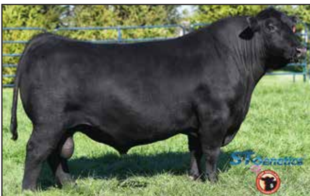
Ellingson Homestead 6030 - Sire of Lot 31

This Ellingson Homestead son should add some frame size, length of body, and extra performance to a calf crop. His daughters should be the keeping kind with a lot of eye appeal and fleshing ability. His Hindquarter dam is off to a great start with a weaning record of 2@103.