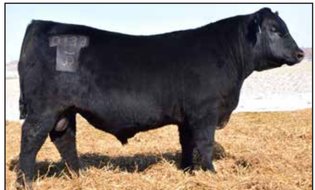
D A R Spur 0133 - Lot 15

This first son to be offered from Spur is certainly a big-time performance bull. He will add pounds to the scale at weaning time. He should make some high producing daughters to go along with his other attributes as his dam has turned in a weaning record of 3@115. Retaining 1/3 Semen Interest.