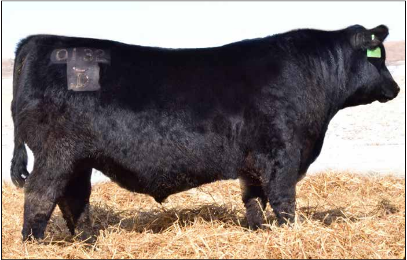
D A R Spur 0132 - Lot 14