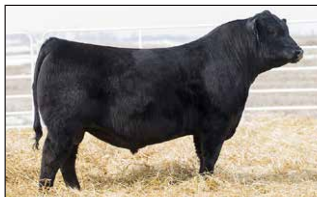
MOGCK Entice - Sire of Lot 58

A bigger statured 38 Special son with added growth. His dam, Jerica 876, produced a son to sell for $36,000 in the 2016 Midland Bull Test, HARB Playboy 581 JH.