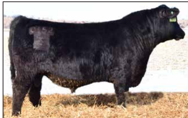
D A R Bankroll 0152 - Lot 25

Here is a very eye appealing son of the popular ABS Pathfinder Sire, KM Broken Bow 002. His powerful dam by S A V Resource 1441 is from one of our favorite cows, Upshot N842. 0156 should produce cattle that feed out well in the feed yard or make phenomenal females with great longevity. Retaining 1/3 Semen Interest.