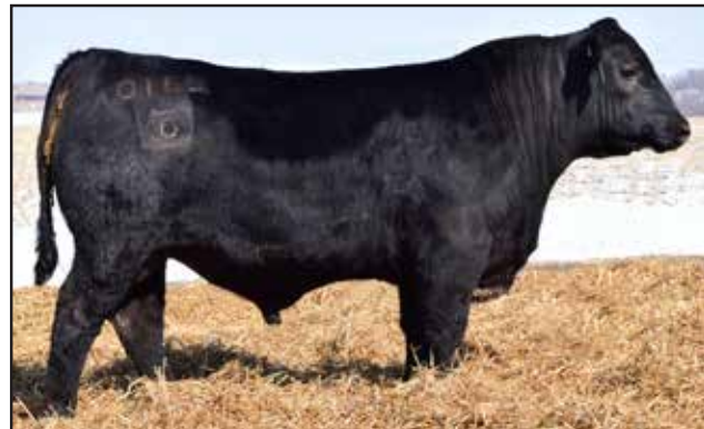
D A R Countdown 0166 - Lot 66

This Countdown son turned in a 700# weaning weight to take his Pathfinder Dam to a record of 5@107 nursing ratio. A slick haired bull that is calving ease and fast growing.