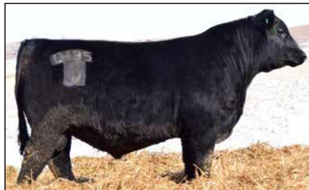
D A R Woodston 0195 - Lot 80

Here is a big EPD spread bull by Ellingson Homestead. This sire group was very well accepted in the sale a year ago. Heifer Bull.