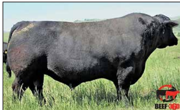
S Summit 4604 - Sire of Lot 29

Niagara 0199 is another calving-ease bull with top-notch performance potential. He should make very nice daughters to keep back in your herd as he was produced by one of our best daughters by Hindquarter. His maternal brother is working at Voss Farms, Almena, Kansas.