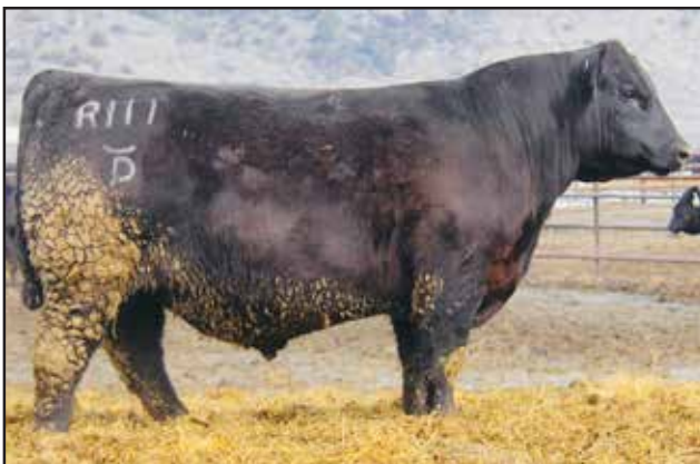
D A R Bull City R111 - Maternal brother to Lots 12 & 13.

A full brother to Lot 12. A sub-zero BW bull with double digit CED in an outcross pedigree. The Coalition daughters are making superb females in the industry. Be one of the first to add these genetics into your program.