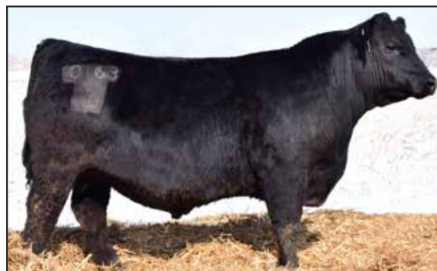
D A R Countdown 0163 - Lot 63

A high growth Countdown son with added length. He's smooth in his shoulder and displays a great phenotype.