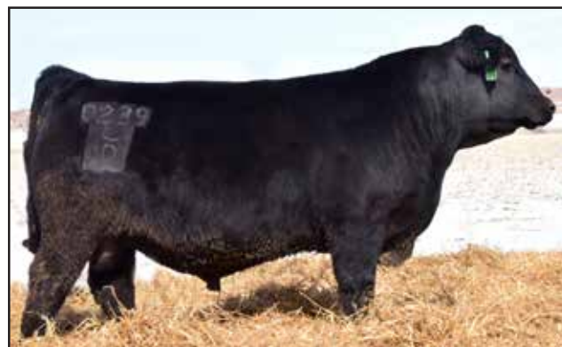
D A R Complement 0239 - Lot 69

This son of Complement 0329 would be expected to make some superior females. His dam is a beautiful uddered Upstart daughter that is always easy to find at pasture with her superior phenotype.