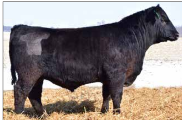
D A R Countdown 0162 - Lot 64

Another 38 Special son with extra stretch to him. His dam, Jerica 876, produced a son to sell for $36,000 in the 2016 Midland Bull Test, HARB Playboy 581 JH.