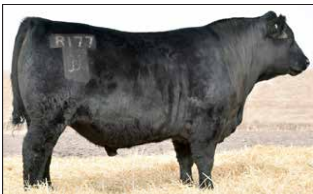
DAR Gunslinger R177 - Sire of Lots 44-46

A moderate birthweight son of Midnight combined with a Payweight daughter. He has some serious performance potential to be used on a set of heifers.