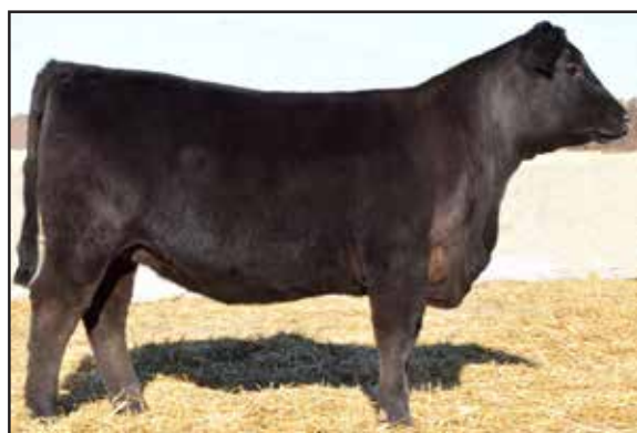
D A R Lucy 0011 - Lot 104

A very special female sired by MOGCK Entice. Her dam is a flush sister to our Herd Sire, D A R Turbo R146, who has sired the top selling bull in the history of our program, D A R Propel T085. She's a very attractive fronted female that is deep bodied and offers outstanding potential to make a great cow. She adds in carcass merit and breeding leading growth numbers.