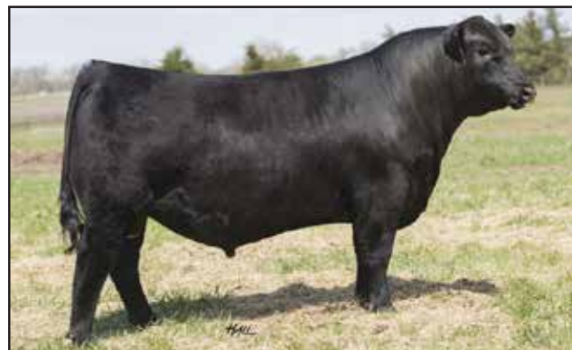
Barstow Bankroll B73 - Sire of Lot 34 and 35

Coal Train son with a ton of stretch and capacity. He will make a tremendous set of feeding cattle.