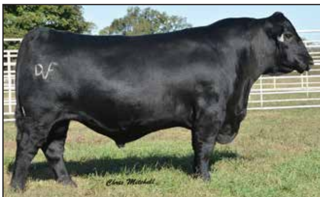
Deer Valley Coal Train 41157 - Sire of Lot 32 and 33

This Southern Charm son is member of the same flush as our lead off heifer, Lot 103, as well as the bulls selling as Lots 6, 7, 8, 9, 10. Maxine P104 is arguably the best cow on the ranch.