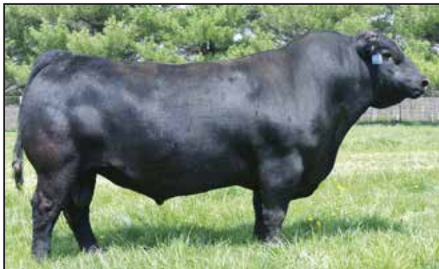
LD Capitalist 316 - Sire of Lot 71 and 72