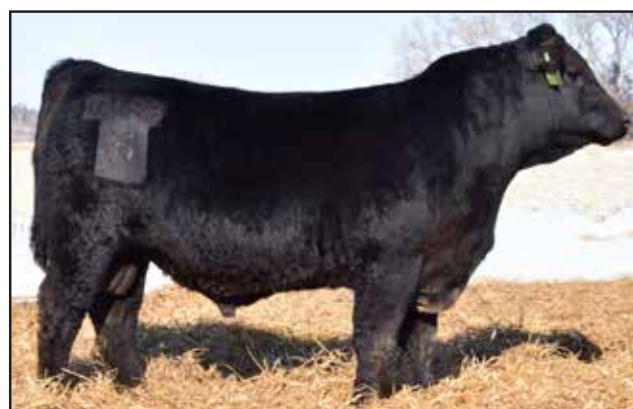
D A R Upstart 0193 - Lot 39

A larger statured Upstart son with added performance. The Upstart females have been outstanding for us for a long time now. They all have perfect udders and fleshing ability that is 2nd to none. A full brother to 0193 is working at Govert Farms, Cunningham, Ks.