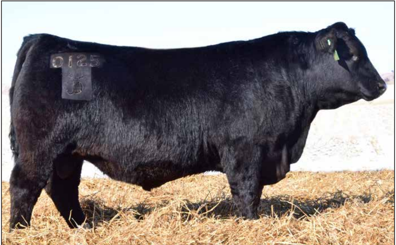
D A R Southern Charm 0125 - Lot 7