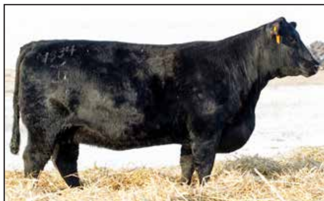
DAR Ms Upgrade N834 - Dam of Lot 86

This Hot Lotto son is moderate in his stature and thick from behind. 0145 is also a maternal brother to our cornerstone donor, P104 who produced that incredible flush of brothers selling as Lots 6-10.