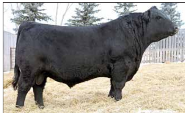
BSF Hot Lotto 1401 - Sire of Lots 53-55

This is the best Investment son we've ever raised. The Erica 105X cow is superior when it comes to making good ones. She produced a daughter to sell for $26,000 in the 2016 Genomic Gems Sale, Texas. She's proven her worth with a production that speaks for itself as she has turned in a weaning ratio of 8@107.