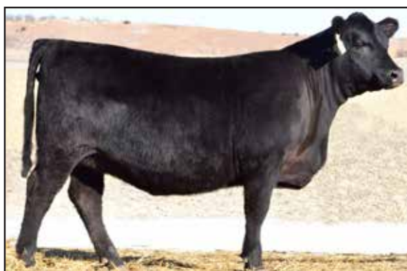
D A R Maxine 0056 - Lot 103