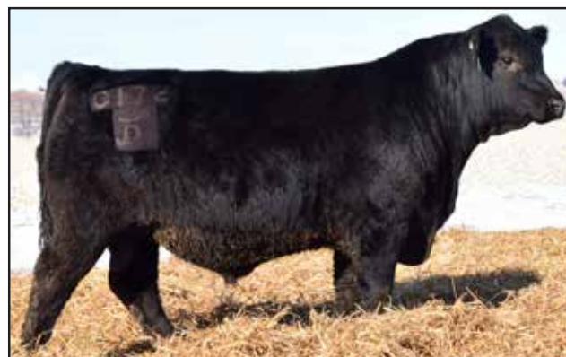
D A R Hindquarter 0172 - Lot 21

A big spread Hindquarter son that weaned off at 700 pounds from his first calf Payweight dam. His maternal sister by Hoover Dam sold for $26,000 at the 2016 Genomic Gems sale in Texas. Heifer bull deluxe.