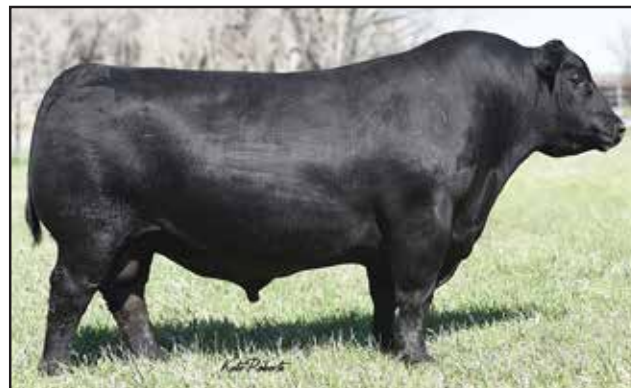
Ellingson Roughrider 4202 - Sire of Lot 95-98

His dam, Jerica 876, produced a son to sell for $36,000 in the 2016 Midland Bull Test, HARB Playboy 581 JH.