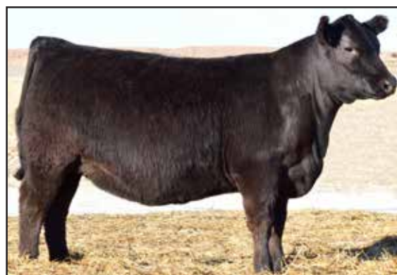
D A R Maxine 0042 - Lot 105

Maxine 0042 is a maternal sister to D A R Turbo R146, who sired the top selling bull in the history of the program. She is a flushmate to the bulls in this offering which sell as Lots 6, 7, 8, 9, 10. A very powerfully constructed female that will be a nice breeding piece many years down the road.