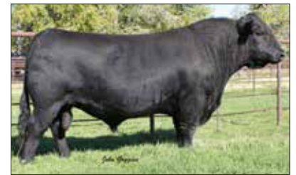
HARB Stur-D 191 JH

($50,000 2012 Midland Bull Test high seller)