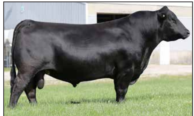
Woodhill Blueprint - Sire of Lot 5

D A R Blueprint 0201 is very easy to find as you enter the pen. He had the heaviest actual weaning weight bull of the natural calves and never slowed down. He's a very attractive bull from a side profile that is straight in his top line, deep middle, smooth fronted, and powerful when viewed from any angle. 0201 is arguably the widest topped bull of the group as well. His dam entered our donor pen this past spring. She produced a son working in Washington state for Wright Way and McCall Angus as well as one of the top sellers in our inaugural sale by Bar D Ranch. Retaining 1/3 Semen Interest.