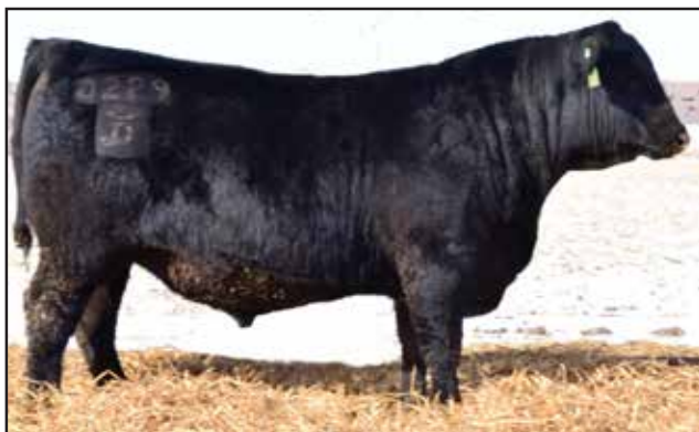
D A R Horsepower 0229 - Lot 57

A very impressive Horsepower son with exceptional performance. You'll find him with extra depth of rib. He's a long spined bull that is packed with meat. He weaned off at over 700#. Scale Crushing performance in this bull.