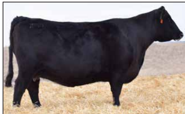
DAR JD Velda IF21 - Maternal Grandam of Lot 89

A double digit CED Investment son that will be a high growth sleep all night heifer bull with a -1.7 BW EPD from the Velda cow family.