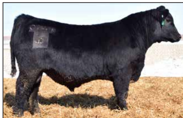
D A R Hot Lotto 0144 - Lot 55

Hot Lotto is the power bull of this flush and he offers the most growth to go along with it. Wide based bull from the ground up with a ton of muscle and performance.