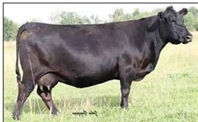
HARB Black Lady 688 JH - Dam of Lot 19 and 20

D A R Resolution 0142 is another eye-appealing performance bull from a proven cow family as mentioned above being a full brother to Lot 19.