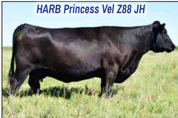
HARB Princess Vel Z88 JH