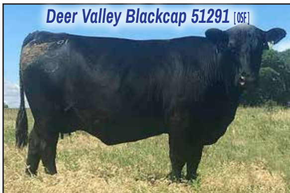
Deer Valley Blackcap 51291 [OSF]