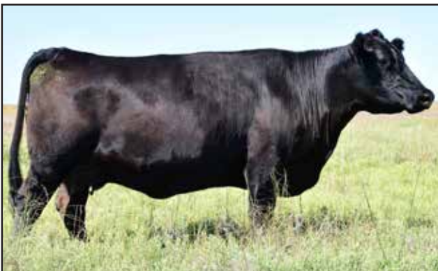
DAR Ms Upstart N832 - Dam of Lot 14