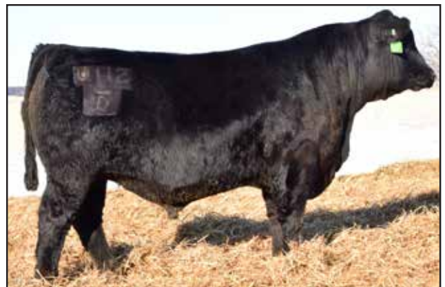
D A R Coalition 0112 - Lot 13