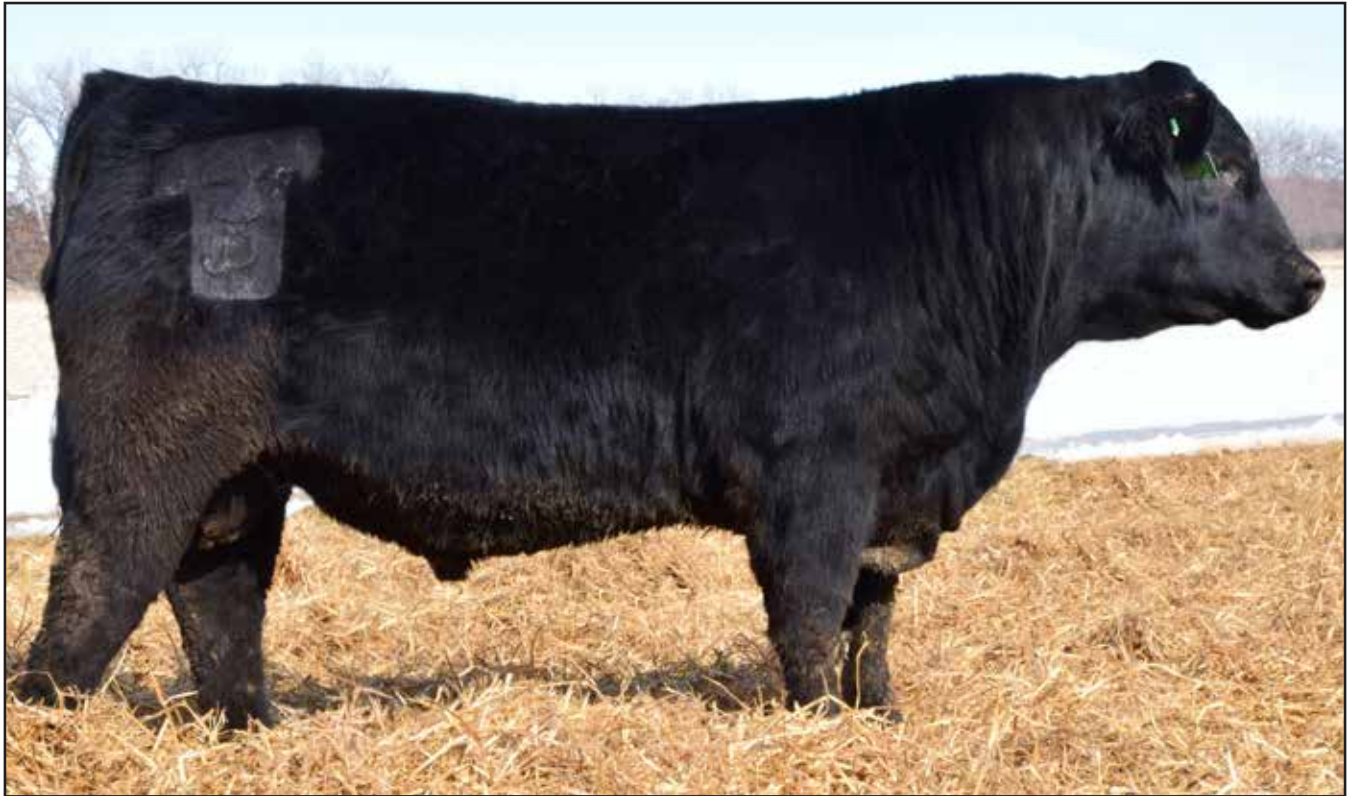
D A R Blueprint 0201 - Lot 5