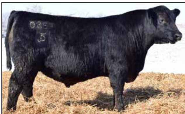
D A R Midnight 0253 - Lot 43

This moderate BW son of Spur is one of the highest marbling bulls in the offering. If you are taking your calves to finish this would be an ideal bull for your operation to gain carcass premiums.