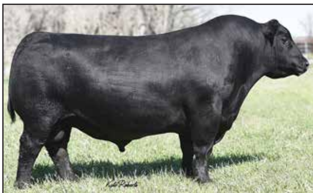
Ellingson Roughrider 4202 - Sire of Lot 47

Here is an added performance son of Coalition. Look for him to produce more pounds at weaning and yearling. His daughters shall not disappoint either.