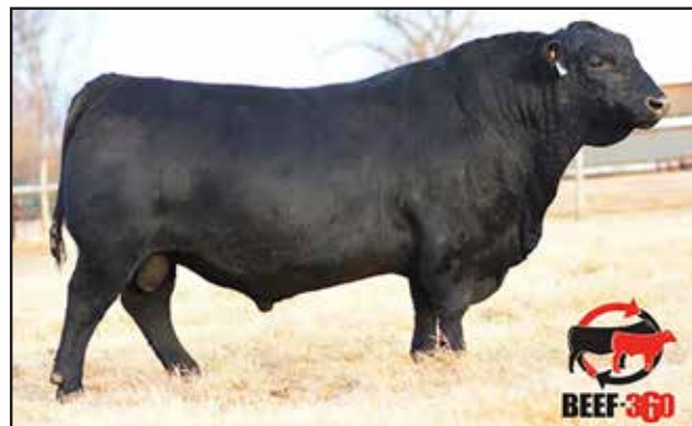
U-2 Coalition 206C - Sire of Lots 48-51

This Roughrider son is a maternal brother to the Lot 1 bull at the 2018 Midland Bull Test, D A R Resolution R106. His impressive Final Answer dam has produced a weaning ratio of 9@104.