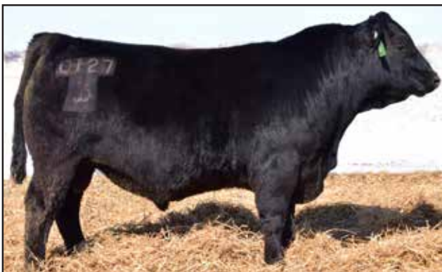
D A R Southern Charm 0127 - Lot 6

Southern Charm 0127 is a true Herd Bull Prospect in every way. He's a rugged made bull. As you study him on the hoof he is a stout made bull with great base width and muscle. He carries the frame size advantage of the flush and he is a long sided bull with plenty of capacity. Study the numbers and he checks all the boxes. His dam is one of the stoutest cows in the herd, as well as our Herd Sire, Turbo's, dam. HERD BULL, Retaining 1/3 Semen Interest.