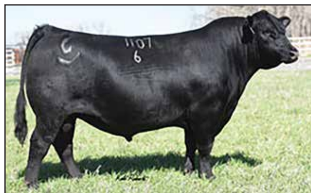
Sitz Alpine 11076 - Sire of Lots 106, 107 & 112

Maxine 0019 is a fancy daughter of our cornerstone donor, P104. She is very angular in her front end with great depth and rib shape. Daughters from the Maxine cow family have turned into outstanding females for us.