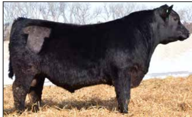
D A R Roughrider 0122 - Lot 40

A moderate framed deep barreled son of Southern Charm. Calving-ease and maternal excellence with great fleshing ability in this bull. His Upstart dam has a perfect udder.