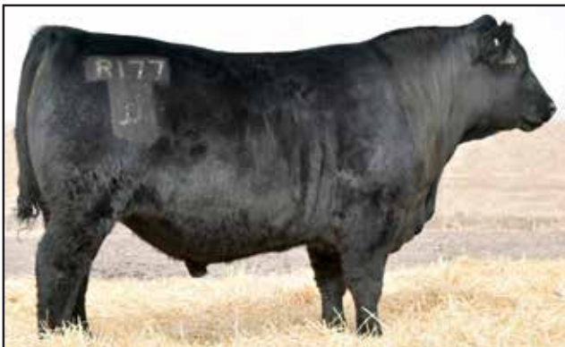
DAR Gunslinger R177 - Sire of Lot 83 and 84

0215 combines two of our own herd sires Gunslinger/Hindquarter. Moderate in his stature with a smooth shoulder and extra muscle.