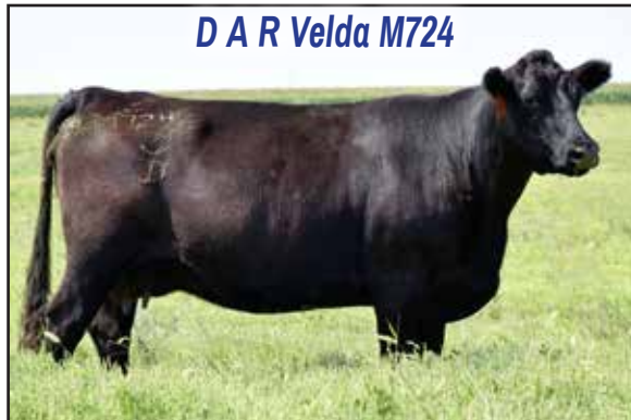
D A R Velda M724