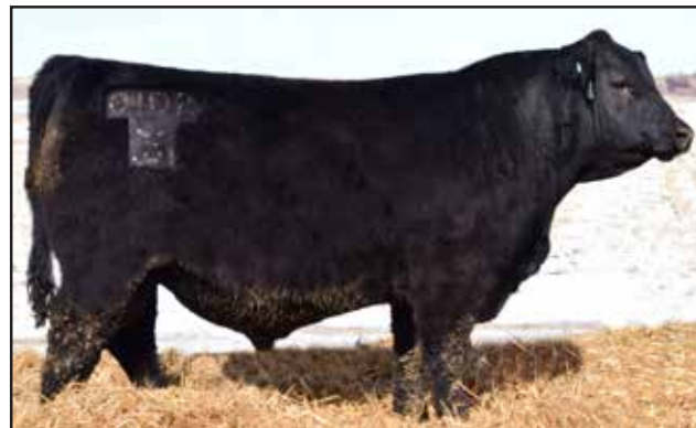
D A R Reno 0102 - Lot 3

D A R Reno 0102 is the more moderate brother of the four, as well as the most calving-ease as well. A deep bodied bull with extra power from behind while being very athletic when put into motion. His dam has produced 4 bulls that have sold for an average of $26,000, including the second high selling bull in last years' sale to John Nilhas. Retaining 1/3 Semen Interest.