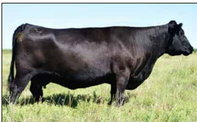
Harb Princess Vel z88 JH - Maternal Sister to the dam of Lot 48

Coalition son produced from the impressive Princess Vel cow family. Power up a set of cows with this bull. Deep sided, thick made bull with loads of capacity and performance.