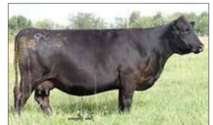
HARB Princess Vel 980 JH

($50,000 2012 Midland Bull Test high seller)