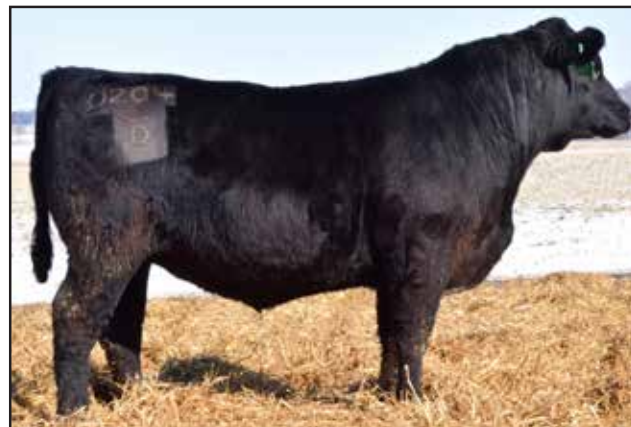
D A R 38 Special 0204 - Lot 59

A Calving Ease and high-performance son of Summit 4604 combined with our High $C cow, Rita Q600. A maternal brother is working for the Kriley Brothers, Stockton.