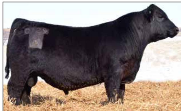
D A R Southern Charm 0129 - Lot 10

Lot 10 is more moderate in his stature but doesn't give up the power/mass anywhere else. High marbling bull of the group that will make some great daughters.