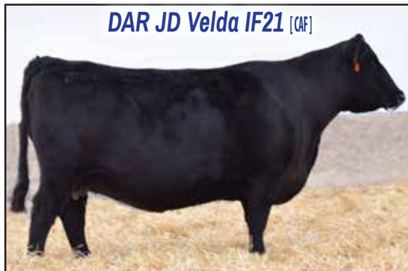
DAR JD Velda IF21 [CAF]