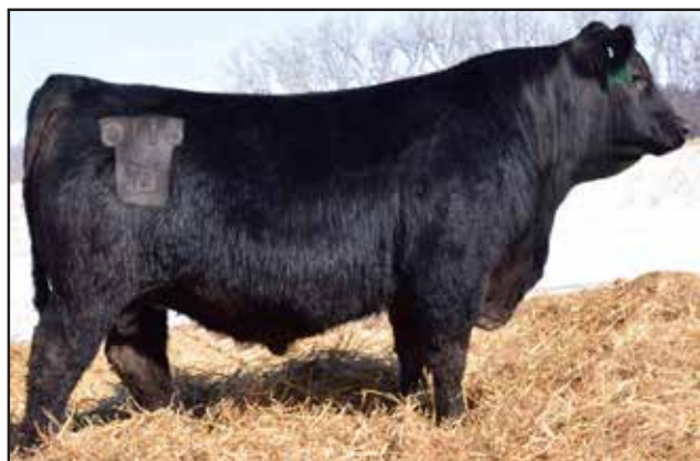
D A R Roughrider 0116 - Lot 24

Roughrider 0116 is produced from an outstanding daughter of Consensus 7229 out of the Velda cow family. She weaned this stud off over 700# to improve her weaning ratio to 5@107 as she will be making her way into our donor pen this spring. Don't miss out on this cow maker of a bull.