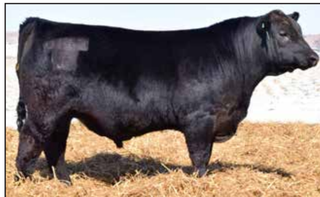
D A R Resolution 0143 - Lot 19

Resolution 0143 is the first of two flush brothers by the incredible Black Lady 688 cow. His dam is a maternal sister to the $25,000 high selling bull at the 2003 Midland Bull Test and GENEX Pathfinder Sire, HARB Windy 702 JH, and the $50,000 high selling bull at 2012 MBT, HARB Stur-D 191 JH. His sire is DAR Resolution R106, who earned Lot 1 honors at the 2018 Midland Bull Test. Performance and efficiency bred deep into this pedigree. Retaining 1/3 Semen Interest.