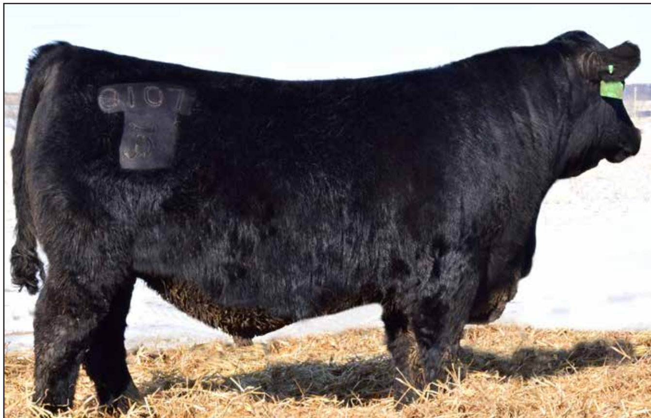
D A R Coalition 0107 - Lot 11

The purchase of 5 or more bulls by a single buyer will earn a 5% discount.