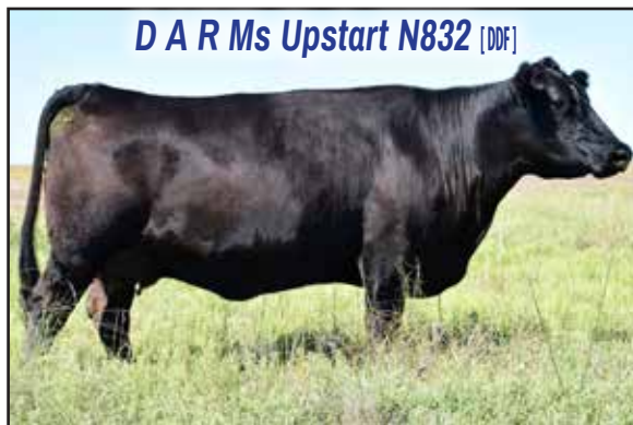
D A R Ms Upstart N832