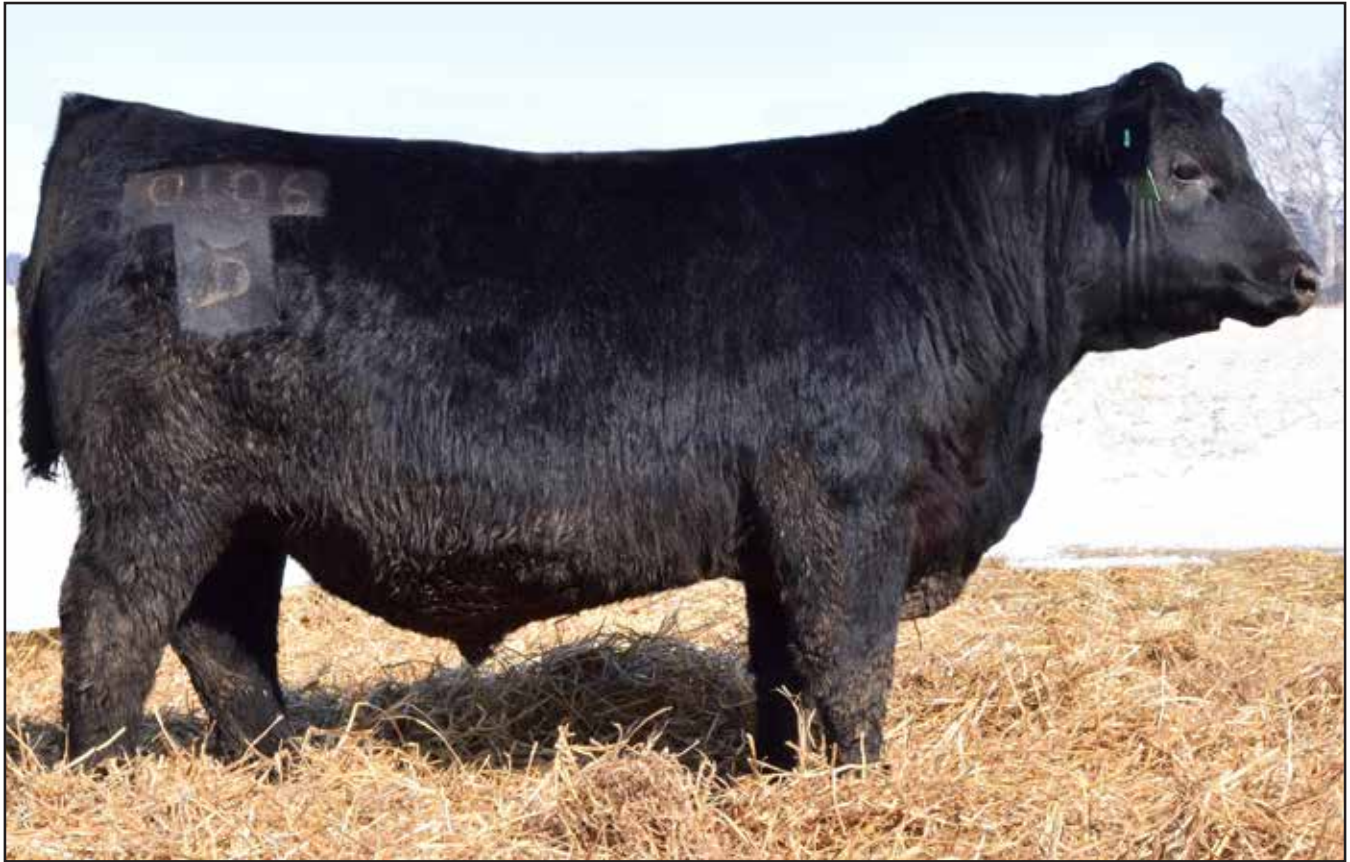
D A R Coalition 0106 - Lot 12