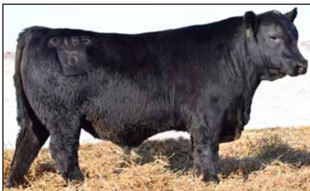
D A R Coal Train 0185 - Lot 33

Here is another Coal Train bull. He offer calving ease and eye appeal. His dam, Black Lady D77, was one our favorite young cows when we purchased the Harrison cow herd.