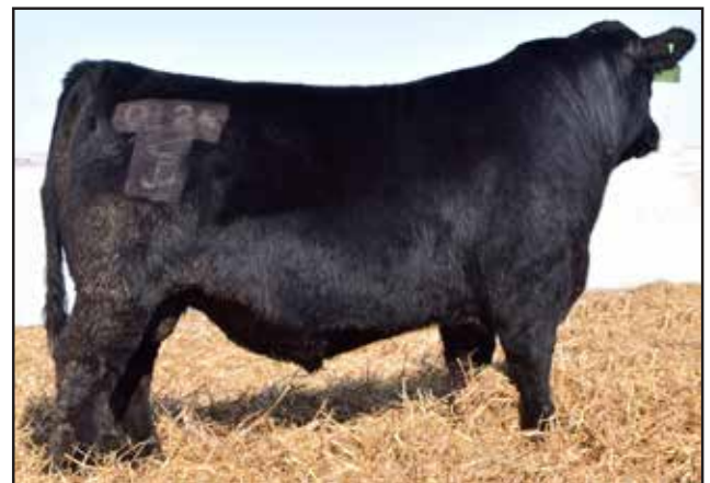
D A R Southern Charm 0126 - Lot 8

Another member of this great flush from P104. He's got extra length and muscle with added marbling. He is the biggest spread bull of the group from calving ease to YW growth. Don't miss a great opportunity in this great Charm son. Retaining 1/3 Semen Interest.