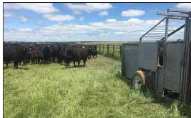
Embryo Transfer day with Dr. Gray and his crew, Cross Country Genetics.

Another calving-ease son of Gunslinger with added growth. Maternal genetics bred deep with a combination of Resource and Hoover Dam stacked up on the maternal side of the pedigree.