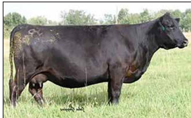
HARB Princess Vel 980 JH - Dam of Lots 1-4

Reno 0104 will lead off the sale as the top performance bull in the offering. He is the first of four flushmates from the best maternal cow to take stride on the ranch, HARB Princess Vel 980 JH. She has produced 4 bulls that have sold for an average of $26,000, including the second high selling bull in last years' sale to John Nilhas. Retaining 1/3 Semen Interest.