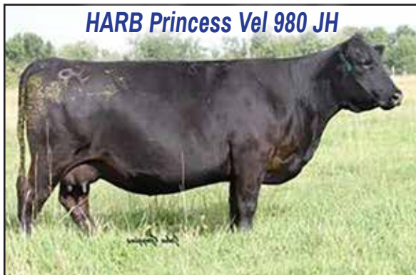
HARB Princess Vel 980 JH