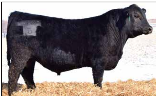
D A R Reno 0101 - Lot 2

Reno 0101 is the big statured, long spined, and power bull of the Reno x 980 flush. He will likely make the type of high producing females that will have tremendous soundness and longevity. From an EPD standpoint, he excels above the other flushmates across the board. Don't miss a big HERD BULL OPPORTUNITY from a phenomenon of a cow. Retaining 1/3 Semen Interest.